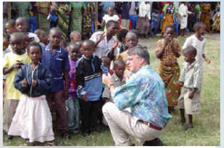
Little children commit their way to Christ and rejoice