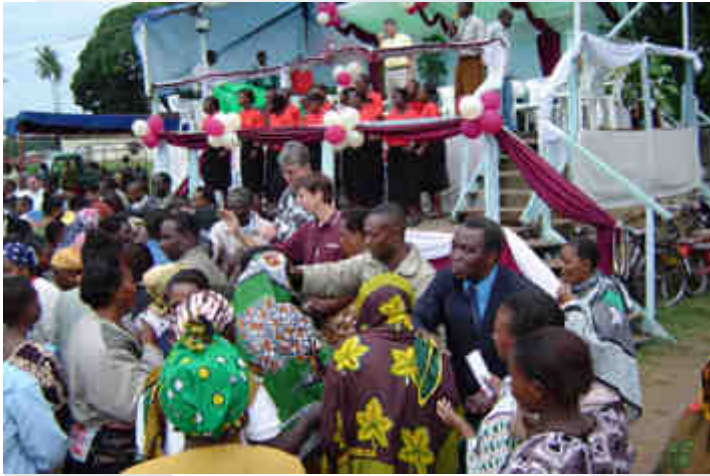
Hundreds come forth to receive healing prayer.